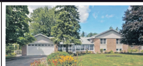
Open House Host: Danella Foy Sunday 2-4 pm 15845 River Dr, Georgetown

Take the Plunge! Vacation at home this summer in your private, hedged backyard with sparkling in-ground pool. This charming 3 bedroom, 2 bath home is located just steps to shopping and Centennial Elementary School. Hardwood in Living & Dining, eat-in Kitchen with W/O, Family Room with W/O and finished basement with Rec Room. $399,900.00 Georgetown MLS# NEW