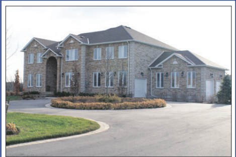
FINE PIDEL RESIDENCE IN BERKELEY ESTATES $1,300,000

Re/Max Real Estate Centre Inc., Brokerage Direct: 905-877-2630 Toll Free: 1-877-433-2630 78 Main St. S., Georgetown