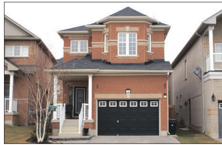
BEAUTIFUL 3 BR 'HICKORY BREEZE' MODEL BY REMINGTON HOMES JUST 6 YEARS NEW! $469,900