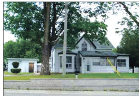
GREAT INVESTMENT HOME... GREAT LOCATION! $345,000