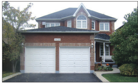
EVEN LITTLE LEGS CAN WALK TO SCHOOL FROM THIS 3 BR, 2-1/2 BATH, PERFECT 1760 SQ FT KENSINGTON MODEL IN G'TOWN SOUTH. $467,900