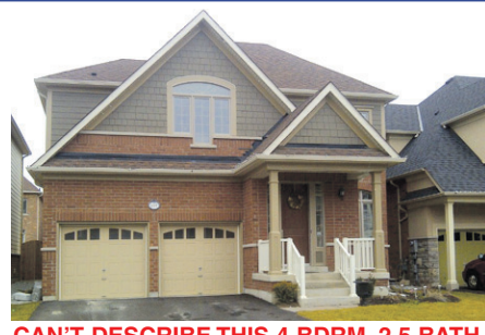
CAN'T DESCRIBE THIS 4 BDRM, 2.5 BATH, TWO STOREY BUILT BY HEATHWOOD $749,900