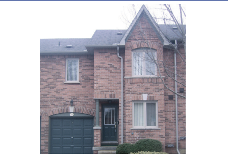
THIS BEAUTIFULLY MAINTAINED LUXURY TOWNHOME IN GEORGETOWN ESTATES IS A MUST SEE! $359,900