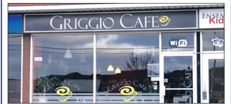
LOVELY CAFE FOR SALE OFFERING WHOLESOME FOOD IN A RELAXING ENVIRONMENT $132,000 Spacious unit with comfortable bench seating for a lazy lunch or a quick bite to eat. Great location in Georgetown, close to high schools and great exposure on Guelph Street. Food is made to order and very fresh!