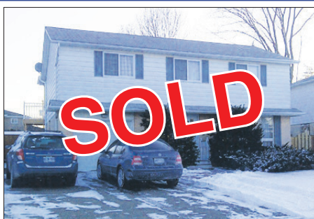
THINK BIG! 5 BDRM! $399,900