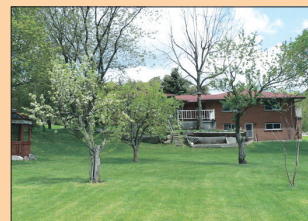
APPROX. 1 ACRE VERY NEAT LAYOUT WITH GREAT ACCESS TO TOWN! $569,900

Sprawling, 4 bdrm California style bungalow features a unique layout with massive principal rooms having soaring cathedral ceilings, 2 floor to ceiling fireplaces, lovely newer kitchen, gleaming hardwood floors, all replaced windows, roof (2005), 200 amp service, high speed internet & freshly painted thruout. Convenient main floor laundry and brand new powder room. Gorgeous mature landscaping, tandem 4 car garage and a long driveway that holds a dozen cars. Excellent location - only 15 minutes to 401 and walk to GO train later this year.