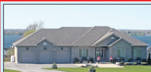
IS IT TIME TO RETIRE...ON THE WATER?? $1,150,000 (BELLEVILLE)

Get the Most Experience Working For You.