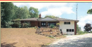
SPECTACULAR 8.6 ACRES IN HALTON HILLS $575,000

Minutes from town & GO Train, a perfect hobby/