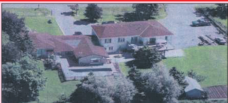
13076 HERITAGE ROAD $678,500

Absolutely marvelous open concept floor plan. Beautiful, show stopper solid maple kit. with massive centre island, stainless steel chimney hood fan, multi-tiered upper cabinets, granite countertops, pot & pan drawers, glass display cabinets, floor to ceiling pantry, etc. Soaring cathedral ceiling in 17 x 17 great rm which is open to kit. and features a gas fireplace & hrdwd flooring. Sep. dining rm or den with 11' ceilings! 3 good-sized bdrms & 2 full bthrms. Ginormous bsmt with oversized windows with great potential.