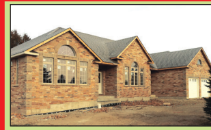
STUNNINGLY APPOINTED KITCHEN ON 1/2 ACRE IN ERIN WITH TOWN WATER, GAS & CABLE $599,900

Absolutely marvelous open concept floor plan. Beautiful, show stopper solid maple kit. with massive centre island, stainless steel chimney hood fan, multi-tiered upper cabinets, granite countertops, pot & pan drawers, glass display cabinets, floor to ceiling pantry, etc. Soaring cathedral ceiling in 17 x 17 great rm which is open to kit. and features a gas fireplace & hrdwd flooring. Sep. dining rm or den with 11' ceilings! 3 good-sized bdrms & 2 full bthrms. Ginormous bsmt with oversized windows with great potential.