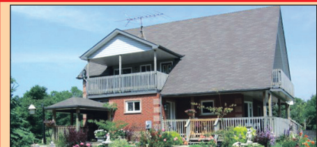
5726 EIGHTH LINE $664,900

This waterfront masterpiece is almost new and absolutely breathtaking on "millionaire's row" in Prince Edward County! Three good sized bdrms & three full bathrooms with a living space right out of a decorating magazine. Amazing windows saturate the back of the house to really appreciate the unbelievable views of deck, inground pool, your very own boardwalk & dock and all with the waterfront backdrop that will put you at peace straight away. Enjoy the swans, the breathtaking sunset view, inhale the fresh air, all the while compromising nothing on quality and top notch interior finishes.