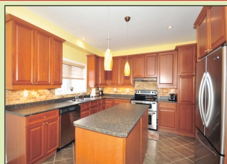
FABULOUS HOME WITH FINISHED WALKOUT BASEMENT AND VIEWS TO LUSH TREES $629,900

4 good-sized bedrooms, spacious main foyer open to gorgeous spiral staircase, lots of gleaming hardwood, family friendly main floor layout with upgd, family size kitchen open to family room featuring gas fireplace. Amazing deck off of kitchen to enjoy the privacy and views of the backyard. The walkout basement is luxuriously finished to add 1100 sq ft or so of impeccable living space. All in a desired, family friendly neighbourhood.