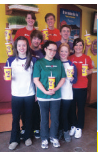
THE BOOSTER JUICE TEAM