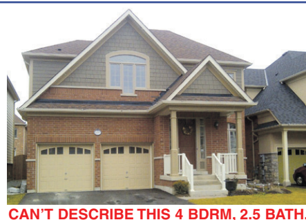
CAN'T DESCRIBE THIS 4 BDRM, 2.5 BATH, TWO STOREY BUILT BY HEATHWOOD $749,900