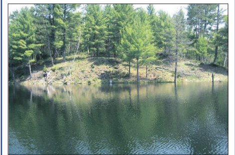
AWESOME 226 ACRES! $349,900