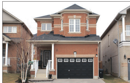
BEAUTIFUL 3 BR 'HICKORY BREEZE' MODEL BY REMINGTON HOMES JUST 6 YEARS NEW! $479,000