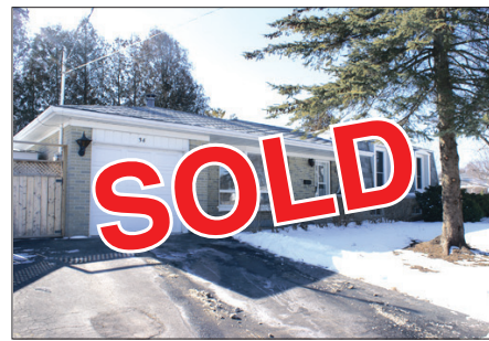
GREAT HOME! DESIRABLE GEORGETOWN AREA $449,900