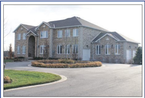
FINE PIDEL RESIDENCE IN BERKELEY ESTATES $1,300,000

Re/Max Real Estate Centre Inc., Brokerage Direct: 905-877-2630 Toll Free: 1-877-433-2630 78 Main St. S., Georgetown