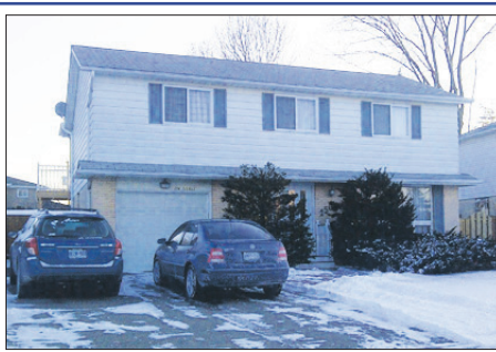
THINK BIG! 5 BDRM! $399,900