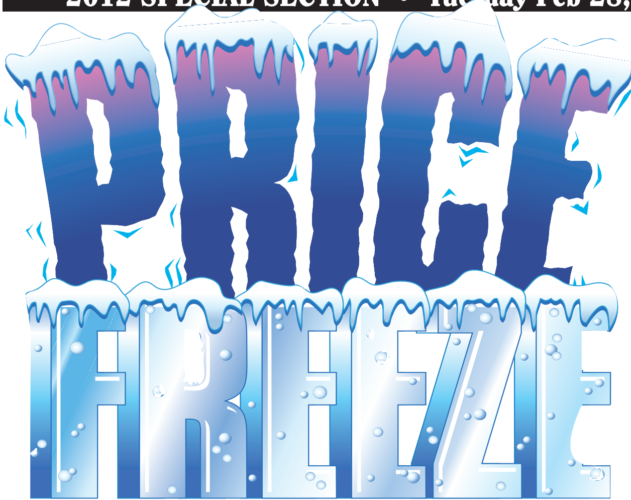
Serving Acton, Georgetown and surrounding areas