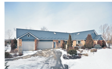
11 ACRES - CLOSE TO 401 $1,375,000