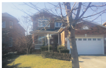
ALL YOUR HEART DESIRES! $629,000