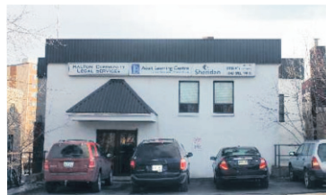
OFFICE SPACE FOR LEASE $790-$830/Month