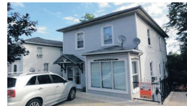
FABULOUS OFFICE SPACE $675/Month