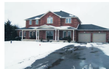
CUSTOM HOME - 1+ ACRES $739,900