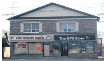
LOCATION! LOCATION! LOCATION! $2,300/Month