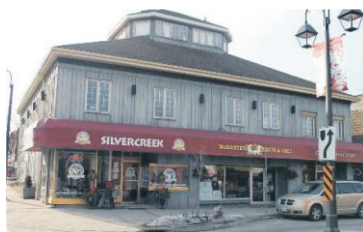
DOWNTOWN PROFESSIONAL OFFICES $325 To $2,700/Month