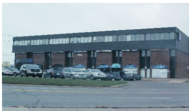
PRIME OFFICE SPACE $13.75/Sq.Ft.