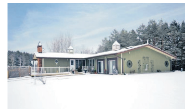
5 BDRM BUNGALOW-10 ACRES-HILLSBURGH $925,000