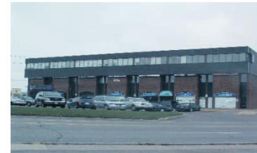
PRIME OFFICE SPACE IN HEART OF TOWN $12.75/Sq Ft