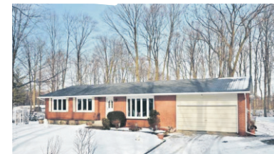
LIMEHOUSE BUNGALOW - OVER AN ACRE $598,500