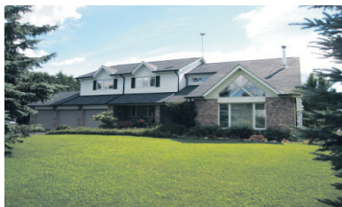
GORGEOUS CUSTOM BUILT 3500 SQ FT HOME $979,000