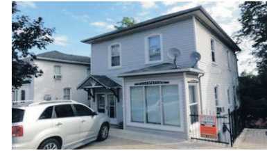
FABULOUS OFFICE SPACE $675/Month