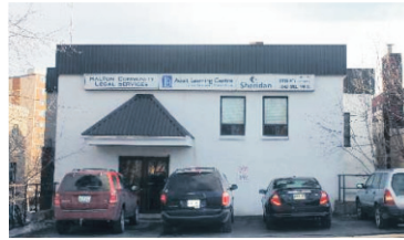
OFFICE SPACE FOR LEASE $790-$830/Month

PresswoodTeam.com 12-017 W2266672/W2266716