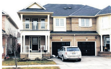
SPARKLING MODERN SEMI $384,900

PresswoodTeam.com 11-479 W2237664/W2237665