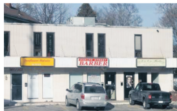
PRIME RETAIL - 2 UNITS FOR LEASE $720/Month to $850/Month

PresswoodTeam.com 12-010 W2266583/W2266628/W2266650/W2266652