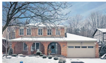
IMMACULATE 4 BDRM W/POOL ON RAVINE $689,900