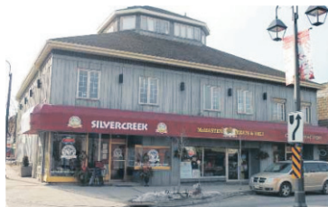
DOWNTOWN PROFESSIONAL OFFICES $325 To $2,700/Month

PresswoodTeam.com 12-010 W2266583/W2266628/W2266650/W2266652