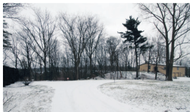
4.6 ACRES - GEORGETOWN'S PARK AREA $1,099,000