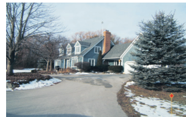
101 ACS IN HALTON-TREE FARM/POND/BARN $1,249,000

PresswoodTeam.com 12-014 W2266576/W2278065