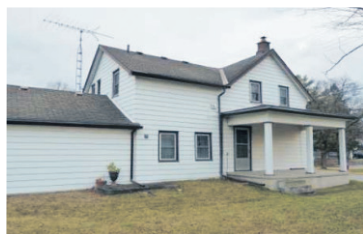
QUAINT OLDER HOME ON HUGE LOT! $239,000