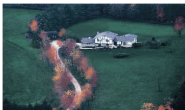
SOUTH ERIN 49 ACRE FARM $824,900