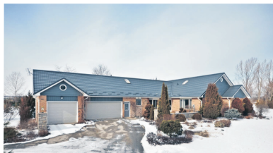
11 ACRES - CLOSE TO 401 $1,375,000

Listing details available at: www.johnsonassociates.ca