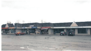
UNITS FOR LEASE $12-$14/SQ.FT.

PresswoodTeam.com 11-453 X2221244/X2221269