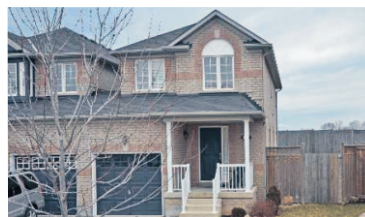
3 BEDROOM ON QUIET CRESCENT $367,500