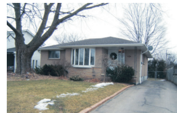
CREAM PUFF BUNGALOW ON QUIET CRESCENT $359,000