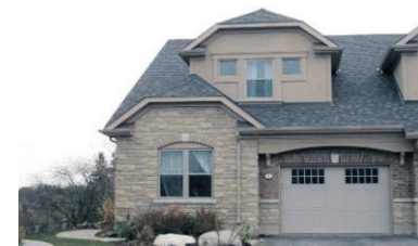
UPGRADED CHARLESTON HOME - willsell.ca $499,900