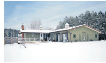
5 BDRM BUNGALOW-10 ACRES-HILLSBURGH $925,000

PresswoodTeam.com 12-017 W2266672/W2266716