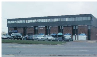
PRIME OFFICE SPACE $13.75/Sq.Ft.

PresswoodTeam.com 11-479 W2237664/W2237665