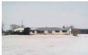
OPPORTUNITY KNOCKS - 10 ACRES $1,199,000