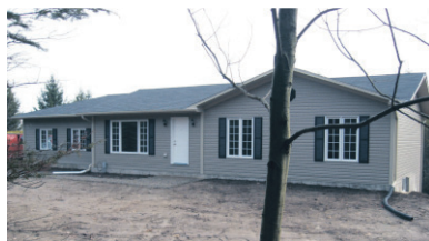
BRAND NEW 3 BEDROOM ON 10 ACRE LOT $599,000