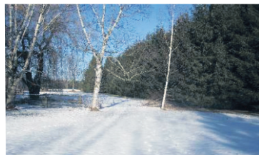
1 ACRE BUILDING LOT $244,000