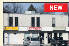
NEW 580/526 SQ. FT. RETAIL