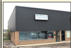
GREAT INDUSTRIAL SUITE FOR SALE OR LEASE

600 sq ft studio ideal for spinning, yoga and other uses. $1000 gross