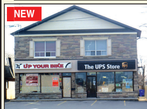
NEW LOCATION! LOCATION! LOCATION! Rarely offered retail space that is located in the heart of Georgetown retail strip. High traffic location that offers high visibility/exposure w/ steady traffic all day long. Call today!!