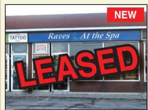
NEW HIGH TRAFFIC RETAIL Located in the heart of Georgetown, across from High School. 1116 sq. ft. MLS# W2271093