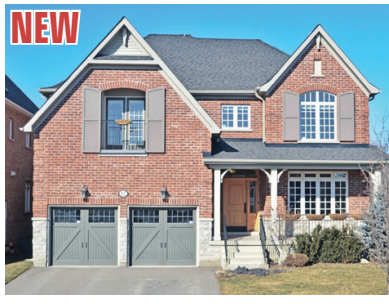
NEW ELEGANT 5 BEDROOM HOME 17 VIEWPOINT CIRCLE, GEORGETOWN 3800+ sq. ft. open concept Double Oak home on a huge ravine lot. Walkout basement. Oversized rooms including a main floor office. Located on a quiet court, steps to schools and ravine trails. $929,900 ViewpointCircle.ca