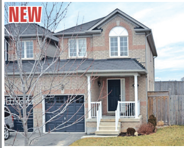
NEW LOVELY OPEN CONCEPT HOME 48 MOWAT CRES., GEORGETOWN Large pie-shaped lot. Master bedroom with ensuite and walk-in closet. Professionally finished basement. $367,500 MLS W2280117 MowatCrescent.ca 12-040