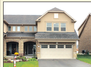
PERFECT LOCK AND LEAVE TOWN HOME Executive Town Home, granite, hardwood, finished basement. $499,900. MLS# W2189181