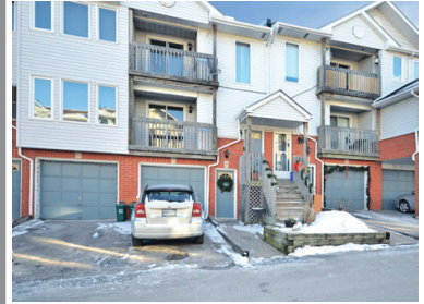
SOLD 15A WYLIE CIRCLE, GEORGETOWN