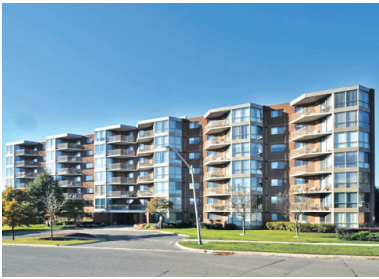
SOLD 26 HALL RD., #208, GEORGETOWN