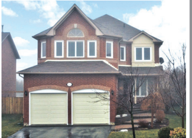
PICTURE PRETTY WITH GREAT UPGRADES 14228 ARGYLL ROAD, GEORGETOWN Great lot; 4 bedrooms; granite; replaced windows; hardwood; all appliances. Shows like a dream! $509,900 MLS W2269879 ArgyllRoad.ca 12-019