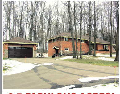
3.5 FABULOUS ACRES! 13 CEDAR DRIVE, CALEDON Lovely spacious 4 level backsplitted with beautiful views of the surrounding countryside. Kit. has 2 walkouts to cedar deck. $729,900 MLS W2276670 CedarDrive.ca 11-299