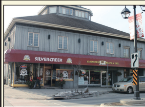
DOWNTOWN PROFESSIONAL OFFICES Multiple office spaces ranging from 171, 308, 480 1639 sq. ft.