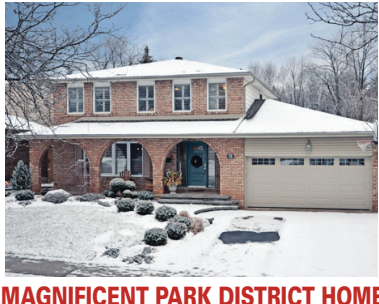
MAGNIFICENT PARK DISTRICT HOME 73 MARY STREET, GEORGETOWN This 4+1 bdrm home has been completely upgraded. Hardwood on main level. Lots of custom cabinetry. 3 walkouts to deck and ravine backyard with inground pool. $689,900 MLS W2275072 MaryStreet.ca 12-029