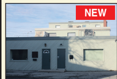
NEW LARGE OPEN OFFICE SPACE