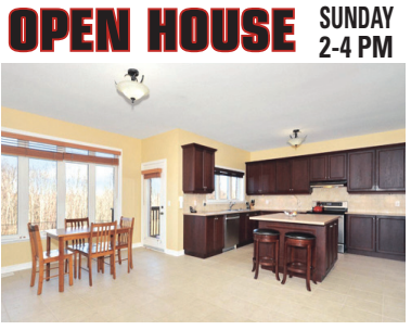
OPEN HOUSE SUNDAY 2-4 PM