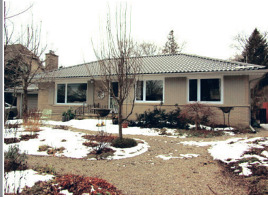
A RARE OFFERING IN THE PARK DISTRICT! 19 MARKET STREET, GEORGETOWN Beautifully maintained and upgraded 1800 sq. ft. bungalow on a 70 x 132 ft. lot with established perennials. Master ensuite has corner whirlpool tub. $694,900 MLS W2230215 Parkdistrict.ca 11-463