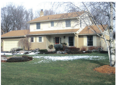
SOLD 4 OAK RIDGE DR., GLEN WILLIAMS