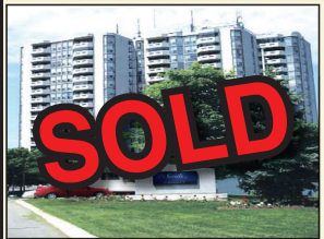
WATCH THE DEER FROM YOUR BALCONY!! Luxury living in upscale building. Great views, largest model. Great opportunity. $286,500 MLS# W2253631