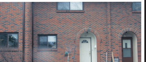
Notes house Host: Karen Hickling Sunday 1-3 pm 13-41 Rhonda Rd, Guelph

It's a Kodak Moment! Picture your family in this 3+1 bdrm, 1 bath bungalow located on a lovely mature lot. Hrdwd and new ceramics thruout main level. Fantastic natural light & storage in the Kitchen. One bdrm offers W/O to deck & yard. Finished basement with large Rec Room, office area & 4th bdrm. Short walk to shopping, schools & park. $344,900.00 Georgetown MLS#NEW