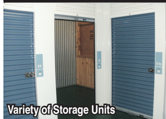
Variety Of Storage Units