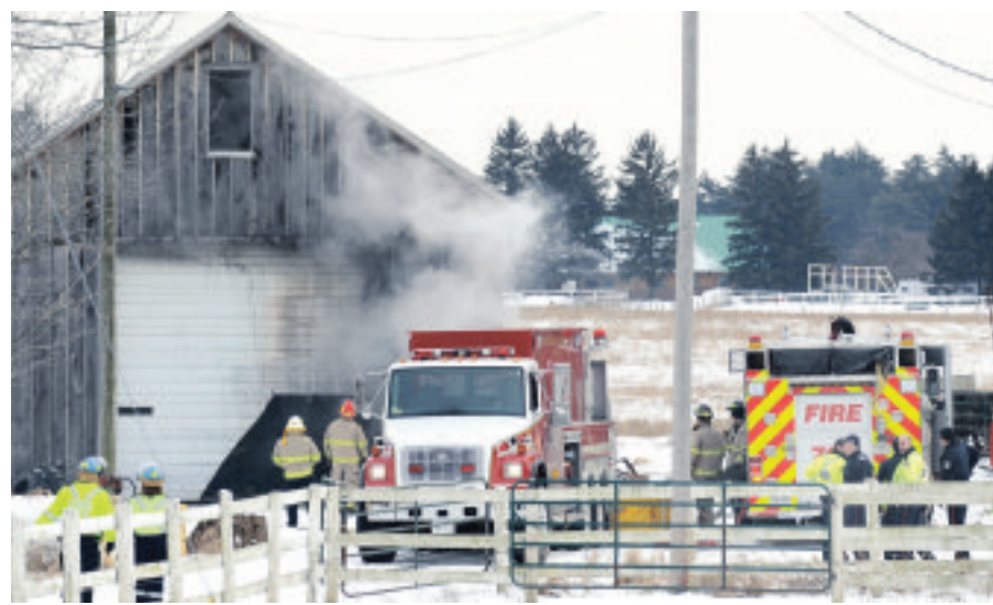
Halton Hills Fire responded to a shed fire on 15 Sideroad, between RR 25 and Fourth Line Monday afternoon. Firefighters quickly doused the blaze, but not before having to use saws to cut open the building's steel exterior to gain access to the fire.