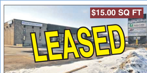
$15.00 SQ FT

COMMERCIAL UNIT FOR LEASE! Spacious front unit approx. 3100 sq. ft. on Guelph Street - great location for your business. Features lots of parking, Highway #7 exposure, 2 pc wsrn, high ceilings, storage area, commercial/retail zoning. Call the Krause Family for your personal viewing. MLS# W2146312