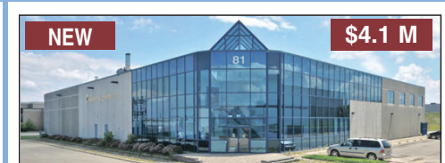
NEW $4.1 M

COMMERCIAL UNIT FOR LEASE! Spacious front unit approx. 3100 sq. ft. on Guelph Street - great location for your business. Features lots of parking, Highway #7 exposure, 2 pc wsrn, high ceilings, storage area, commercial/retail zoning. Call the Krause Family for your personal viewing. MLS# W2146312