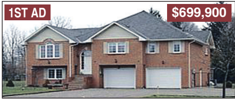
1ST AD $699,900

EXCLUSIVE OPPORTUNITY IN GEORGETOWN CALL FOR DETAILS!!!