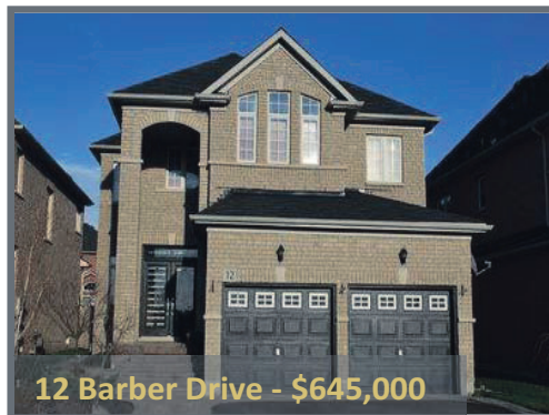
12 Barber Drive - $645,000

**Home featured in upcoming HGTV series** Absolutely gorgeous 4 + 1 bedroom home! Thousands spent on upgrades including: extending upper maple cabinets, extended pantry, granite counters, and hardwood in living, dining and family room. Large master with luxurious ensuite, glass shower, spacious bedrooms, Prof. finished basement features stone wall with glass fireplace, fifth bedroom, 3 pc washroom, interlock in the front, deck in the backyard and so much more. Book your appointment