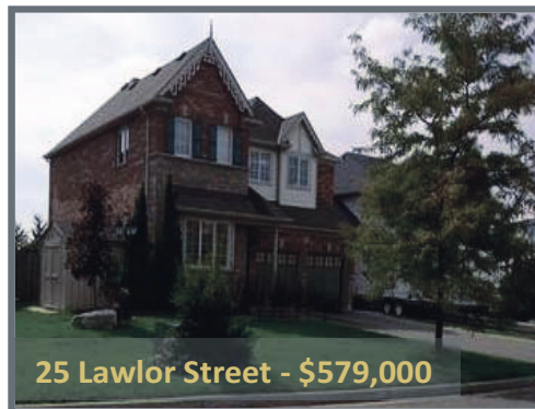
25 Lawlor Street - $579,000

**Home featured in upcoming HGTV series** Absolutely gorgeous 4 + 1 bedroom home! Thousands spent on upgrades including: extending upper maple cabinets, extended pantry, granite counters, and hardwood in living, dining and family room. Large master with luxurious ensuite, glass shower, spacious bedrooms, Prof. finished basement features stone wall with glass fireplace, fifth bedroom, 3 pc washroom, interlock in the front, deck in the backyard and so much more. Book your appointment