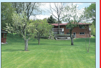
APPROX. 1 ACRE OF GORGEOUSNESS, VERY NEAT LAYOUT WITH GREAT ACCESS TO TOWN! $569,900

Sprawling, 4 bdrm California style bungalow features an unique layout with massive principal rooms having soaring cathedral ceilings, 2 floor to ceiling fireplaces, lovely newer kitchen, gleaming hardwood floors, all replaced windows, roof (2005), 200 amp service, high speed internet & freshly painted thruout. Convenient main floor laundry and brand new powder room. Gorgeous mature landscaping, tandem 4 car garage and a long driveway that holds a dozen cars. Excellent location - only 15 minutes to 401 and walk to GO train later this year.