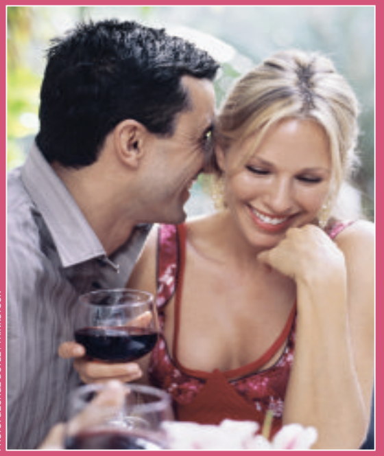
A declaration of love is sure to profoundly touch the love of your life.

If shyness is holding you back, send an e-mail or a hand-written letter, the truly romantic option. A different solution is to offer a CD of a song, the words of which are a perfect expression of your feelings. Another way to express your love is by giving a truly personal gift, showing that you know and appreciate your loved one in every possible way. This will give emphasis to your words, engraving them in your true-love's memory for eternity