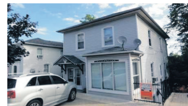
FABULOUS OFFICE SPACE $675/MONTH