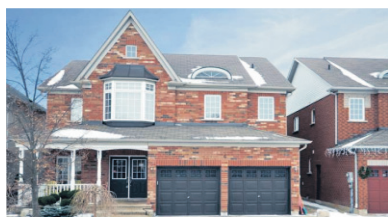
LOVELY 5 BEDROOM IN STEWARTS MILL $649,900

Listing details available at: www.johnsonassociates.ca