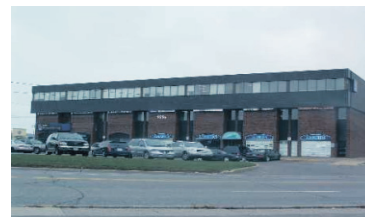
PRIME OFFICE SPACE IN HEART OF TOWN $12.75/Sq Ft