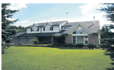
GORGEOUS CUSTOM BUILT 3500 SQ FT HOME $979,000