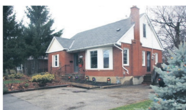
LOVELY 3 BEDROOM PARK AREA HOME $390,000