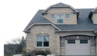
UPGRADED CHARLESTON HOME - willsell.ca $499,900