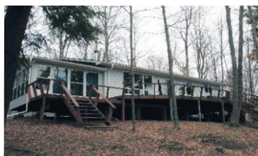
2 BEDROOM WATERFRONT COTTAGE $229,000