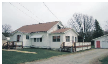
THREE BEDROOM ON DEAD END STREET $145,000