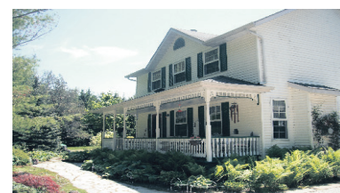
SERENE COUNTRY LIVING-MOVE IN CONDITION $489,900