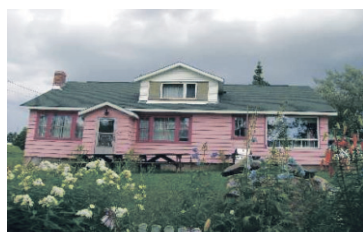
6 BDRM COTTAGE OVERLOOKS WILSON LAKE $149,000