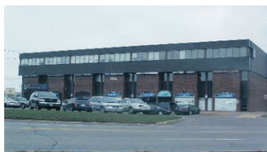
PRIME OFFICE SPACE $13.75/Sq.Ft.

PresswoodTeam.com 11-479 W2237664/W2237665