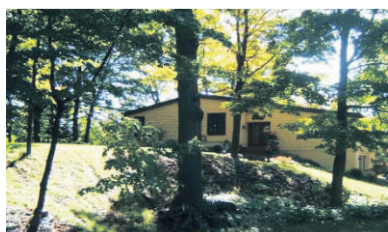
4.6 ACRES - GEORGETOWN'S PARK AREA $1,325,000