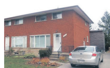
RENTAL INVESTMENT! $324,000