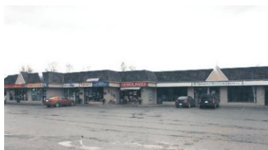
UNITS FOR LEASE $12-$14/SQ.FT.

PresswoodTeam.com 11-453 X2221244/X2221269