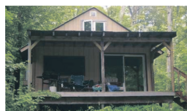
WATERFRONT LOT ON CLEAR LAKE $169,000