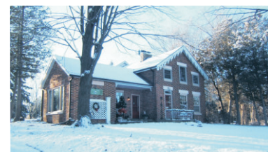
GRACIOUS 1857 CENTURY HOME $795,000