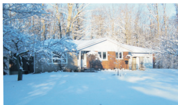
23 ACRES, POND, CABIN $699,900