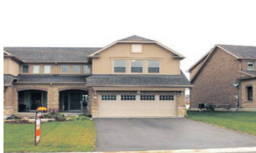
CHARLESTON HOME - FIN TOP TO BOTTOM! $499,900

PresswoodTeam.com 11-453 X2221244/X2221269