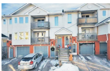
GREAT FIRST TIME BUYER CHOICE $194,900