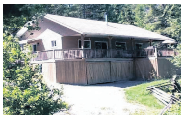
A MUST SEE WINTERIZED COTTAGE $850/Month