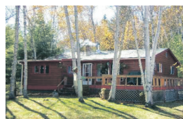
BEAUTIFUL WATERFRONT COTTAGE $259,000