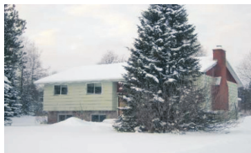
RAISED BUNGALOW ON 92 ACRES $189,900

PresswoodTeam.com 11-479 W2237664/W2237665