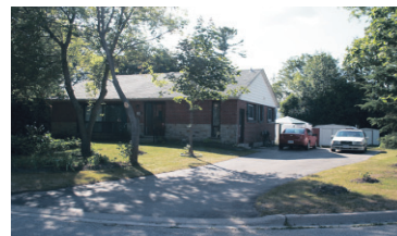
ERIN VILLAGE BUNGALOW $349,800