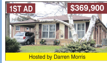
1ST AD $369,900

Hosted by Donna Rae This 4+1 bdrm, 4 washroom home is on a large pie-shaped lot in a quiet neighbourhood in desirable Georgetown South. Open concept kitchen overlooks breakfast area with walkout to large deck and private yard. This home features a cozy family rm with wood burning fireplace and separate formal dining rm. Mstr bdrm has a walk-in closet and 4 pc private ensuite. Lots of room in the finished bsm! Short drive to the 401 and close to all amenities! MLS# W2262821