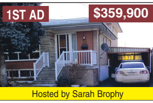
1ST AD $359,900

This 4 bdrm, 2 wshrm home in desirable Glen Williams is absolutely stunning!! The fully upgraded kitchen with hrwd flrs & granite countertops overlooks the spacious din/lam room with a w/o to gorgeous deck & private yard. The living room features a cathedral ceiling and gas fireplace with 9' ceilings throughout the main floor. Master bdrm features private ensuite and w/i closet. Berber carpets and 9' ceilings throughout the 2nd floor and cathedral ceiling in one of the bdrms. 5 skylights in this house let in endless sunlight. The list of upgrades is endless!! Call The Krause Family & Friends Team today for your personal viewing!! MLS# W2262537