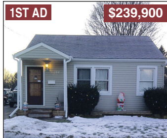
1ST AD $239,900

Hosted by Sarah Brophy LOCATION, LOCATION, LOCATION!!! This fabulous home in TO is only steps from the TTC and close to all amenities including shopping, parks & schools!! The spacious e/i kit. has new countertops & refinished cabinets. Main floor family/dining room combo has beautiful hrwd flooring and a large picture window overlooking mature trees in the front yard. Master bdrm features a large closet & hrwd flooring that continues throughout the rest of the bdrms. Recently updated windows, furnace & AC. Call The Krause Family & Friends Team today to see it for yourself!! MLS # W2261792