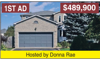
1ST AD $489,900

IT'S WORTH THE DRIVE TO ACTON This cute and cozy 2 bedroom bungalow in Acton has a detached shop and is set on a large 50' x 150' lot!! Located in a quiet family friendly area, within walking distance to schools, shopping and parks!! Master bdrm has walkout to large deck and backyard, perfect for entertaining!! Don't hesitate, this home won't last long!! Call The Krause Family and Friends Team now for your personal showing!!