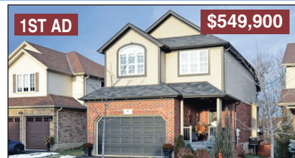
1ST AD $549,900

For all your real estate needs, call the Krause Family & Friends Team!! We'll work hard to get you the best price for your home!! 905-877-5211