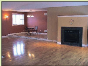
MASSIVE MULTI FAMILY HOME - UNIQUE DESIGN $678,500

A dream location 5 min. from G'town or Brampton and set on approx. 1 acre. This 6 bedroom, 5 bath home is of massive proportions. Features 3 separate entrances, 2 furnaces, 4 oversized garages, circular driveway, inground pool with concrete patio & steel fencing. Huge principal rooms, perfect for entertaining, 2 fireplaces and a combination of hardwood, ceramics, laminate and broadloom flooring. Whole house has been rejuvenated with stucco exterior, vinyl windows and roof shingles. Call us for a viewing. EXCELLENT VALUE!