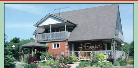
5726 EIGHTH LINE $664,900

Never lived in, absolutely marvelous open concept floor plan. Beautiful, show stopper solid maple kitchen with massive centre island to gather round, stainless steel chimney hood fan, multi-tiered upper cabinets, granite countertops, pot & pan drawers, glass display cabinets, floor to ceiling pantry, etc., and that's just the kitchen! Soaring cathedral ceiling in 17 x 17 great rm which is open to kit. and features a gas fireplace & hrdwd flooring. Separate dining room or den with 11' ceilings! Three good-sized bdrms & 2 full bathrooms. Ginormous bsmt with oversized windows with great potential for finishing!