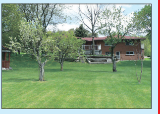
APPROX. 1 ACRE OF GORGEOUSNESS, VERY NEAT LAYOUT WITH GREAT ACCESS TO TOWN! $569,900

Sprawling, 4 bdrm California style bungalow features an unique layout with massive principal rooms having soaring cathedral ceilings, 2 floor to ceiling fireplaces, lovely newer kitchen, gleaming hardwood floors, all replaced windows, roof (2005), 200 amp service, high speed internet & freshly painted thruout. Convenient main floor laundry and brand new powder room. Gorgeous mature landscaping, tandem 4 car garage and a long driveway that holds a dozen cars. Excellent location - only 15 minutes to 401 and walk to GO train later this year.