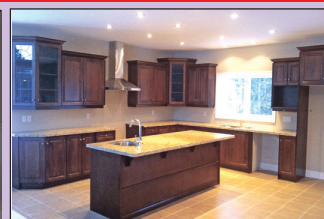
STUNNINGLY APPOINTED KITCHEN ON 1/2 ACRE IN ERIN WITH TOWN WATER, GAS & CABLE $599,900

Never lived in, absolutely marvelous open concept floor plan. Beautiful, show stopper solid maple kitchen with massive centre island to gather round, stainless steel chimney hood fan, multi-tiered upper cabinets, granite countertops, pot & pan drawers, glass display cabinets, floor to ceiling pantry, etc., and that's just the kitchen! Soaring cathedral ceiling in 17 x 17 great rm which is open to kit. and features a gas fireplace & hrdwd flooring. Separate dining room or den with 11' ceilings! Three good-sized bdrms & 2 full bathrooms. Ginormous bsmt with oversized windows with great potential for finishing!