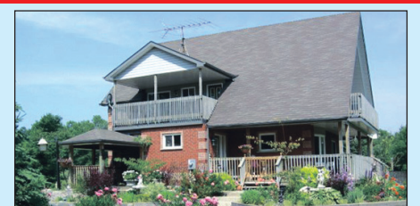
5726 EIGHTH LINE $664,900

Never lived in, absolutely marvelous open concept floor plan. Beautiful, show stopper solid maple kitchen with massive centre island to gather round, stainless steel chimney hood fan, multi-tiered upper cabinets, granite countertops, pot & pan drawers, glass display cabinets, floor to ceiling pantry, etc., and that's just the kitchen! Soaring cathedral ceiling in 17 x 17 great rm which is open to kit. and features a gas fireplace & hrdwd flooring. Separate dining room or den with 11' ceilings! Three good-sized bdrms & 2 full bathrooms. Ginormous bsmt with oversized windows with great potential for finishing!