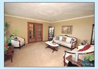
SPECTACULAR 8.6 ACRES IN HALTON HILLS $575,000

Minutes from town & GO Train, a perfect hobby/horse farm or nature lover's retreat with ultimate privacy provided by majestic trees, 2 ponds, lovely gardens & a steel barn with 3 paddocks. Sprawling 3+2 bedrooms, 3 baths bungalow with lots of updates including replaced windows & exterior doors, furnace & much more. Bright totally finished lower level with front & rear walkouts with loads of space for nanny, in-laws, home office or additional living space. Includes appliances & a riding lawn mower. Fantastic value for this gorgeous property. Close proximity to 2 golf courses. What more do you need?