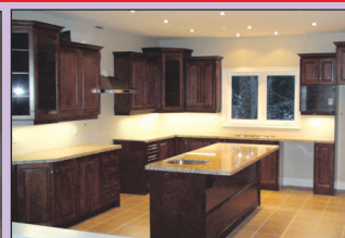
STUNNINGLY APPOINTED KITCHEN ON 1/2 ACRE IN ERIN $599,900

Never lived in, absolutely marvelous open concept floor plan. Beautiful, show stopper solid maple kitchen with massive centre island to gather round, stainless steel chimney hood fan, multi-tiered upper cabinets, granite countertops, pot & pan drawers, glass display cabinets, floor to ceiling pantry, etc., and that's just the kitchen! Soaring cathedral ceiling in 17 x 17 great rm which is open to kit. and features a gas fireplace & hrdwd flooring. Separate dining room or den with 11' ceilings! Three good-sized bdrms & 2 full bathrooms. Ginormous bsmt with oversized windows with great potential for finishing!