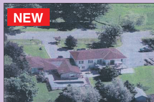
MASSIVE MULTI FAMILY HOME - UNIQUE DESIGN $678,500

Minutes from town & GO Train, a perfect hobby/horse farm or nature lover's retreat with ultimate privacy provided by majestic trees, 2 ponds, lovely gardens & a steel barn with 3 paddocks. Sprawling 3+2 bedrooms, 3 baths bungalow with lots of updates including replaced windows & exterior doors, furnace & much more. Bright totally finished lower level with front & rear walkouts with loads of space for nanny, in-laws, home office or additional living space. Includes appliances & a riding lawn mower. Fantastic value for this gorgeous property. Close proximity to 2 golf courses. What more do you need?