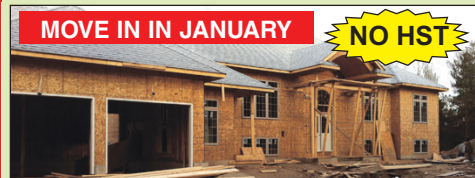
MOVE IN IN JANUARY NO HST

This waterfront masterpiece is almost new and absolutely breathtaking on "millionaire's row" in Prince Edward County! Three good sized bdrms & three full bathrooms with a living space right out of a decorating magazine. Amazing windows saturate the back of the house to really appreciate the unbelievable views of deck, inground pool, your very own boardwalk & dock and all with the waterfront backdrop that will put you at peace straight away. Enjoy the swans, the breathtaking sunset view, inhale the fresh air, all the while compromising nothing on quality and top notch interior finishes.