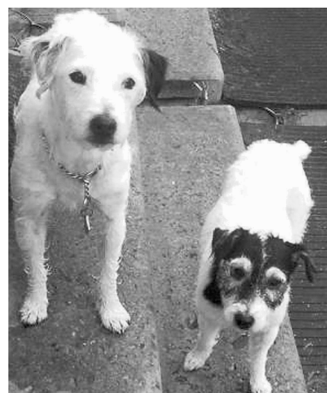
Chico (left) and Chiquita

Interested? Call the Shelter at 519-833-2287 or email adoptions@uppercredit.com