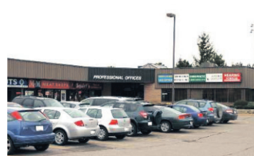
PROFESSIONAL OFFICE SPACE $13/SQ.FT.