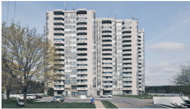
LUXURY LIVING - UPSCALE BUILDING! $286,500