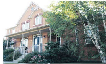
ELEGANT! EXTRAVAGANT! MAGNIFICENT! $799,900