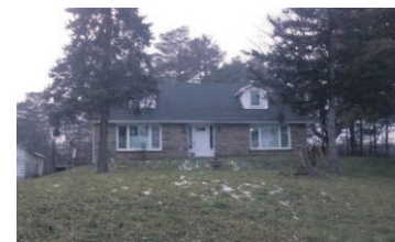
RARE IN TOWN 2 ACRES $674,000