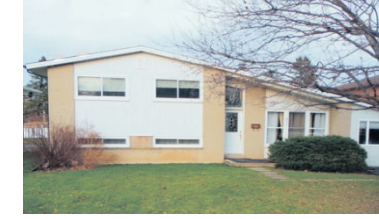
RENOVATED WITH DOUBLE GARAGE $439,000