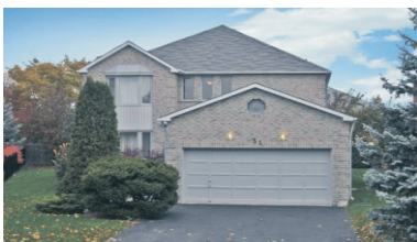
4 BDRM 2530 SQ FT G'TOWN SOUTH BEAUTY $579,975