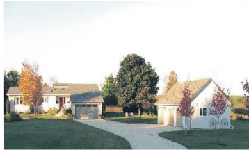
MAGICAL 23.9 ACRES IN MONO $885,000