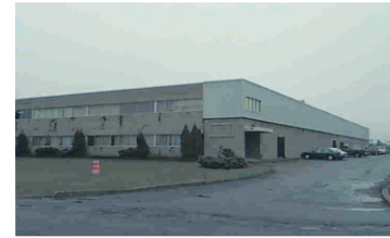
SPACE FOR LEASE $1,000/MONTH