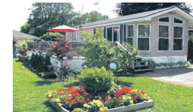
FABULOUS MAPLE LEAF ACRES $69,900