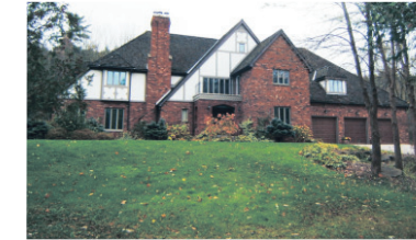
CUSTOM BUILT HOME ON 3.6 ACRES IN THE GLEN $1,299,000