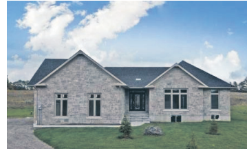
SPECTACULAR EXECUTIVE HOME-willsell.ca $699,900