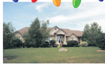
EXQUISITE EXECUTIVE $1,649,000