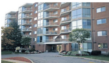
AWESOME PRICE! $229,900