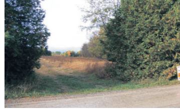
GREAT PLACE TO BUILD YOUR DREAM HOME $220,000