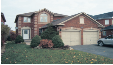
POPULAR CHARLESTON MODEL ON RAVINE $539,900