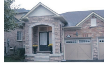
SPACIOUS & BEAUTIFUL BUNGALOW SEMI $379,900