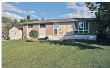
BRING YOUR DECORATING IDEAS! $289,900