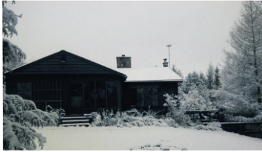
10 ACRE HOBBY FARM - A TON OF POTENTIAL! $539,000