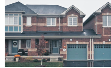
BEAUTIFUL OPEN CONCEPT TOWNHOME $379,000