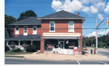
LOOKING FOR EXPOSURE - YOU HAVE FOUND IT! $1,500/Month