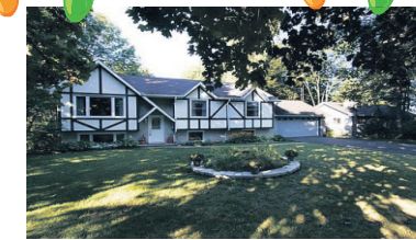
HOME + STUDIO - 3.5 ACRES! $675,000