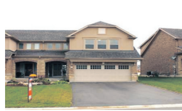
CHARLESTON HOME FIN TOP TO BOTTOM $499,900