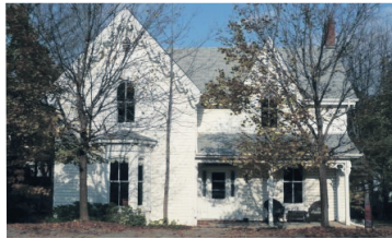
COMMERCIAL BEAUTY! $595,000