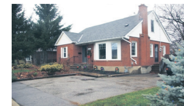
WRAP IT UP WITH A BIG RED BOW! $390,000