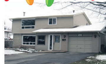
VIRTUAL TOUR AT WWW.WILLSSELL.CA $368,900