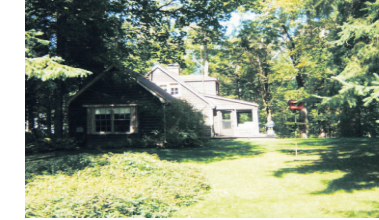
DELIGHTFUL 8+ ACRE PROPERTY $549,000