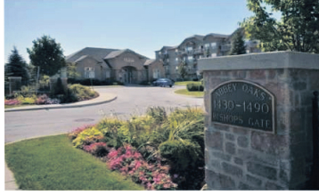
PRESTIGIOUS GLEN ABBY CONDO $232,900