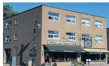
GREAT INVESTMENT OPPORTUNITY $750,000