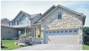
COUNTLESS UPGRADES IN GUELPH $449,000