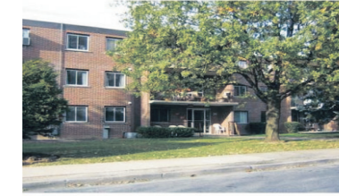
GREAT FOR FIRST TIME BUYERS! $116,000