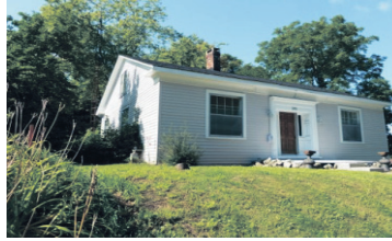
3 BEDROOM CHARMER $237,000