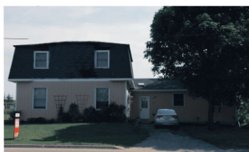
ROOM FOR THE EXTENDED FAMILY! $349,000