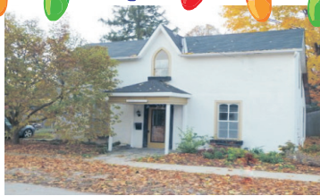
A BEAUTIFUL PIECE OF HISTORY $389,000

PresswoodTeam.com 11-479 W2237664/W2237665