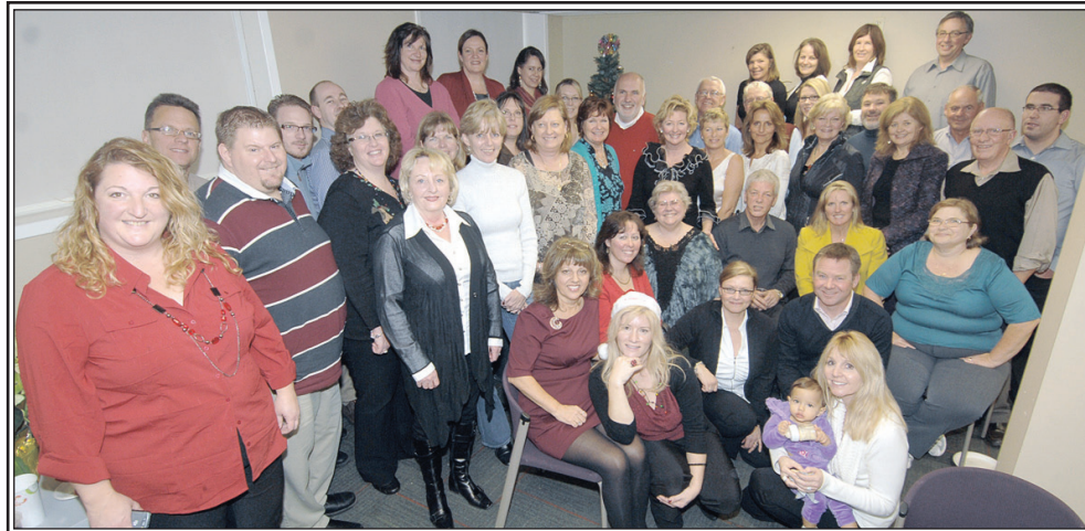
Johnson Associates realtors gathered at their office to take part in collecting gifts for the needy in Georgetown, Acton and Erin as part of their Johnsons Gives Back program. This year, the group concentrated on collecting gifts for single adults, providing practical gifts to that group of society who is often the least provided for.