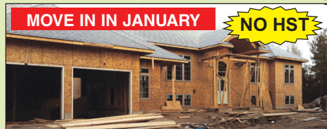
MOVE IN IN JANUARY NO HST

This waterfront masterpiece is almost new and absolutely breathtaking on "millionaire's row" in Prince Edward County! Three good sized bdrms & three full bathrooms with a living space right out of a decorating magazine. Amazing windows saturate the back of the house to really appreciate the unbelievable views of deck, inground pool, your very own boardwalk & dock and all with the waterfront backdrop that will put you at peace straight away. Enjoy the swans, the breathtaking sunset view, inhale the fresh air, all the while compromising nothing on quality and top notch interior finishes.