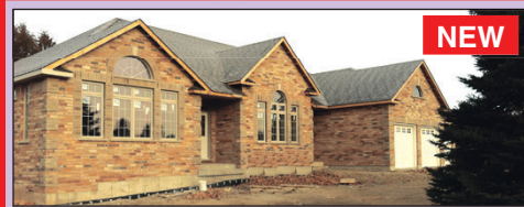
STUNNINGLY APPOINTED KITCHEN ON 1/2 ACRE IN ERIN $599,900

With best wishes and much gratitude, for your friendship and support. We really appreciate your business, and wish you and your family the most joyous of seasons. And heartfelt thanks to all of you!