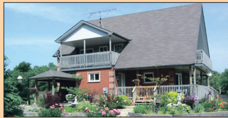
5726 EIGHTH LINE $664,900

A dream location 5 min. from Georgetown or Brampton and set on approx. 1 acre. This 6 bedroom, 5 bath home is of massive proportions. Features 3 separate entrances, 2 furnaces, 4 oversized garages, circular driveway, inground pool with concrete patio & steel fencing. Huge principal rooms, perfect for entertaining, 2 fireplaces and a combination of hrdwd, ceramics, laminate & broadloom flooring. Whole house has been rejuvenated with stucco exterior, vinyl windows & roof shingles. Call for a viewing. EXCELLENT VALUE!