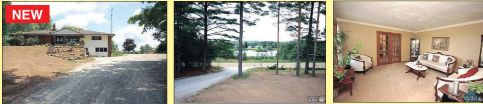
SPECTACULAR 8.6 ACRES IN HALTON HILLS $575,000

Minutes from town & GO Train, a perfect hobby/horse farm or nature lover's retreat with ultimate privacy provided by majestic trees, 2 ponds, lovely gardens & a steel barn with 3 paddocks. Sprawling 3+2 bedrooms, 3 baths bungalow with lots of updates including replaced windows & exterior doors, furnace & much more. Bright totally finished lower level with front & rear walkouts with loads of space for nanny, in-laws, home office or additional living space. Includes appliances & a riding lawn mower. Fantastic value for this gorgeous property. Close proximity to 2 golf courses. What more do you need?