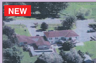
MASSIVE MULTI FAMILY HOME - UNIQUE DESIGN $678,500

Minutes from town & GO Train, a perfect hobby/horse farm or nature lover's retreat with ultimate privacy provided by majestic trees, 2 ponds, lovely gardens & a steel barn with 3 paddocks. Sprawling 3+2 bedrooms, 3 baths bungalow with lots of updates including replaced windows & exterior doors, furnace & much more. Bright totally finished lower level with front & rear walkouts with loads of space for nanny, in-laws, home office or additional living space. Includes appliances & a riding lawn mower. Fantastic value for this gorgeous property. Close proximity to 2 golf courses. What more do you need?