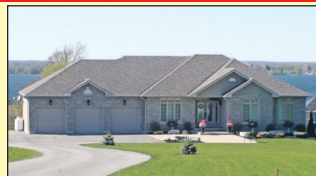
IS IT TIME TO RETIRE...ON THE WATER?? $1,150,000 (BELLEVILLE)

JUST SOLD Get the Most Experience Working For You.