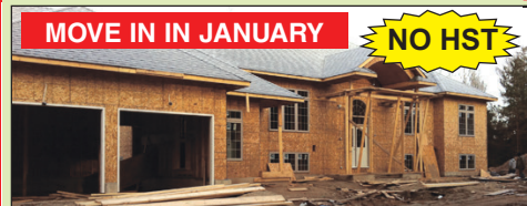
MOVE IN IN JANUARY NO HST

This waterfront masterpiece is almost new and absolutely breathtaking on "millionaire's row" in Prince Edward County! Three good sized bdrms & three full bathrooms with a living space right out of a decorating magazine. Amazing windows saturate the back of the house to really appreciate the unbelievable views of deck, inground pool, your very own boardwalk & dock and all with the waterfront backdrop that will put you at peace straight away. Enjoy the swans, the breathtaking sunset view, inhale the fresh air, all the while compromising nothing on quality and top notch interior finishes.