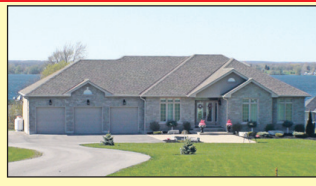
IS IT TIME TO RETIRE...ON THE WATER?? $1,150,000 (BELLEVILLE)

JUST SOLD Get the Most Experience Working For You.