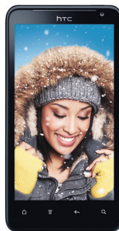
HTC Raider™ 4G LTE