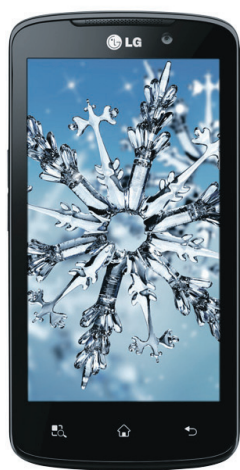
LG Optimus 4G LTE