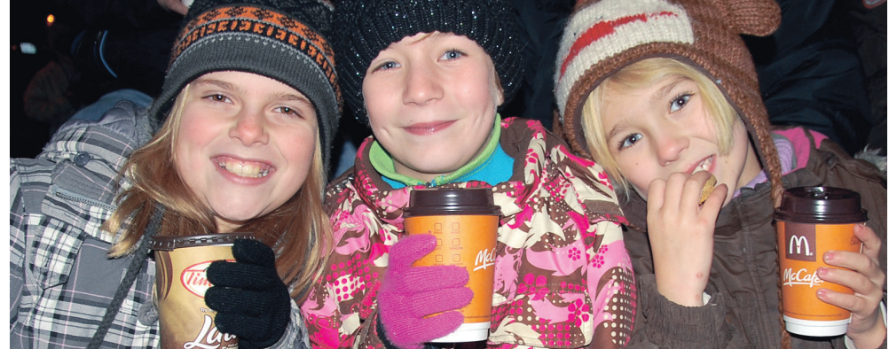
Light Up the Hills at Acton Sports Park meant good friends, happy times, and welcome hot chocolate and cookies, courtesy of Tim Hortons and McDonald's.