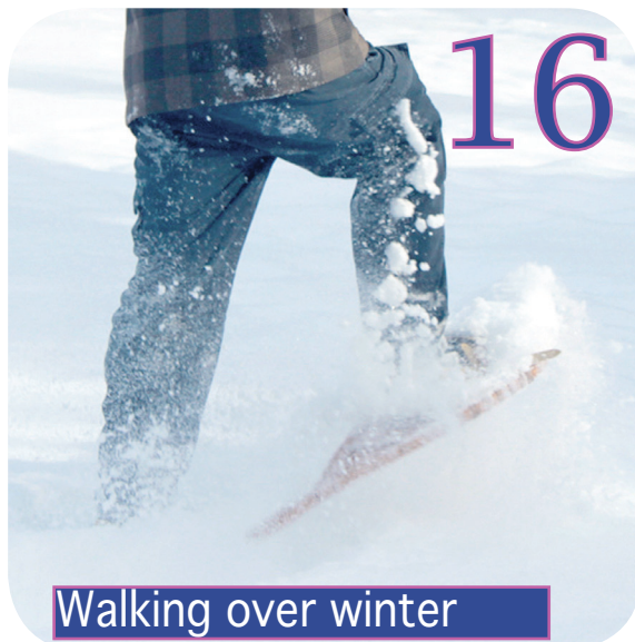
Walking over winter