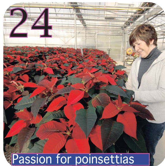
Passion for poinsettias