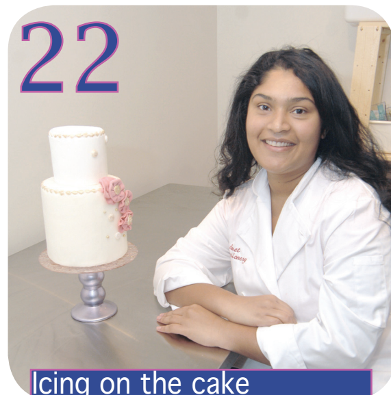
Icing on the cake