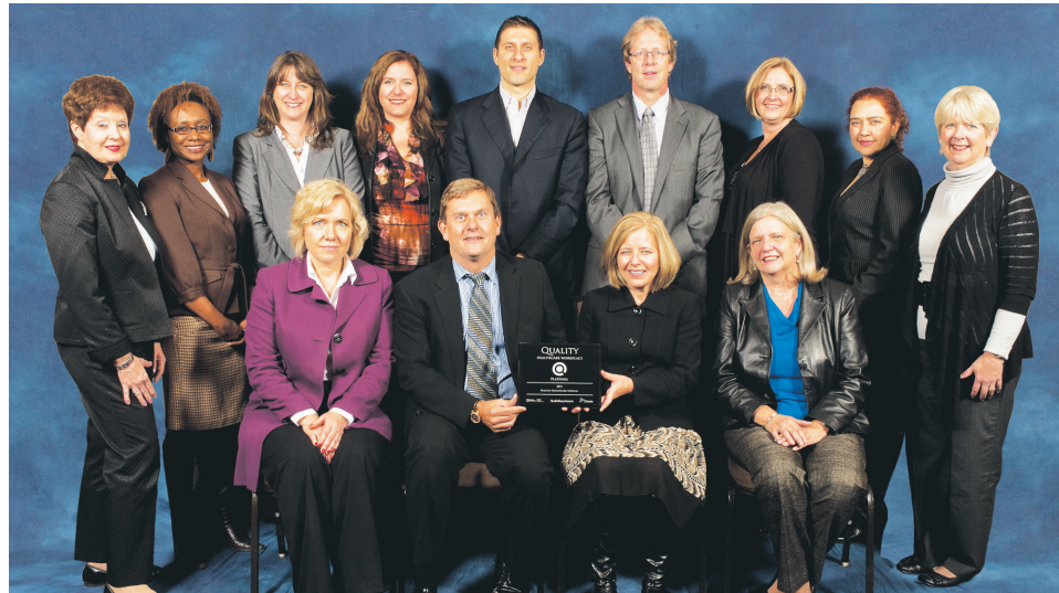
The Halton Healthcare Services team accepts the Platinum Quality Healthcare Workplace Award at the Ontario Hospital Association's 2011 Health Achieve Conference.

Halton Healthcare Services (HHS) was one of five healthcare organizations awarded a PLATINUM Quality Healthcare Workplace Award by the Ontario Hospital Association's (OHA) and the Ministry of Health and Long-Term Care.