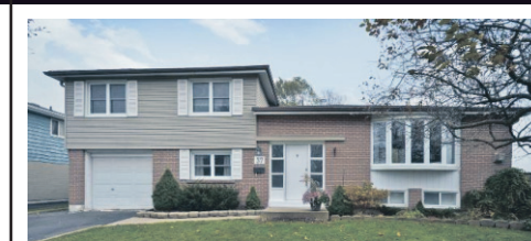
Open house Hosts: Danella Fey Sunday 2-4 pm 37 Moore Park Cres., Georgetown

All Things Bright & Beautiful! Sun-filled Sitting Room welcomes you into this 5 bdrm, 2.5 bath home that offers a charm & warmth found only in Century Homes. Gorgeous pine floors, back porch & gazebo overlooking backyard with 1/6 pool, 4 generous bedrooms & 2 full baths on 2nd level, 3rd level loft, home yoga studio and so much more! $799,900.00 Georgetown MLS#W2228003