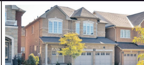
Open House Host: Karen Hickling Sunday 2-4 pm 61 Oblate Cres., Brampton

Your Family Is all that's needed to fill this 4 bdrm, 2.5 bath home. Main level with great layout including formal Living Room & Dining Room, Family Room with hardwood & gas fireplace, eat-in Kitchen & Breakfast Area with W/O to patio and private, fully fenced backyard. The double garage has room for all your bikes, trikes & a little red wagon! $574,900.00 Georgetown MLS#W2220615