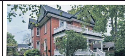
Open House Host: Holly Light Sunday 2-4 pm 7 Park Ave., Georgetown

We Have the Key to Your Future! A 4 bedroom, 2.5 bath home with a great layout and spacious sun-filled rooms. Lovely dark hardwood floors on main level. Eat-in Kitchen with W/O to fenced backyard. Family Room with gas F/P. Endless possibilities in basement with 3 finished areas. Located just minutes to Hwy 407 for easy commute. $569,900.00 Brampton MLS#W2215542