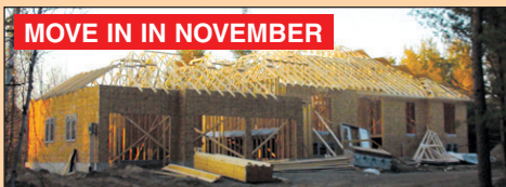
MOVE IN IN NOVEMBER

Sprawling, 4 bdrm California style bungalow features an unique layout with massive principal rooms having soaring cathedral ceilings, 2 floor to ceiling fireplaces, lovely newer kitchen, gleaming hardwood floors, all replaced windows, roof (2005), 200 amp service, high speed internet & freshly painted thruout. Convenient main floor laundry and brand new powder room. Gorgeous mature landscaping, tandem 4 car garage and a long driveway that holds a dozen cars. Excellent location - only 15 minutes to 401 and walk to GO train later this year.