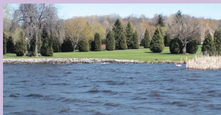
IS IT TIME TO RETIRE...ON THE WATER?? $1,150,000 (BELLEVILLE)

This waterfront masterpiece is almost new and absolutely breathtaking on "millionaire's row" in Prince Edward County! Three good sized bdrms & three full bathrooms with a living space right out of a decorating magazine. Amazing windows saturate the back of the house to really appreciate the unbelievable views of deck, inground pool, your very own boardwalk & dock and all with the waterfront backdrop that will put you at peace straight away. Enjoy the swans, the breathtaking sunset view, inhale the fresh air, all the while compromising nothing on quality and top notch interior finishes. Call us for details.