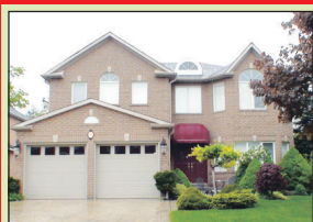
RAVINE BACKDROP RIGHT OUT OF A MAGAZINE ON AN "IT" STREET IN G'TOWN SOUTH $834,900

Stunning, all brick, custom home featuring a modern open concept design & a unique blend of elegance & country charm. Beautifully decorated & recently improved with richly stained walnut floors, ceramics & lovely new trim & baseboards. Impressive great room with floor-to-cathedral ceiling brick fireplace. Full 1 bdrm inlaw suite beautifully done with games room, living rm w/stone fireplace & lots of pot lights. Detached dbl car garage plus a fantastic workshop (30'x55') with heat, hydro, water, 14' ceiling, 2 truck doors & mezzanine. Great location - just 20 min. to Georgetown GO. Call for full details.