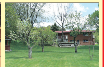
APPROX. 1 ACRE OF GORGUESNESS, VERY NEAT LAYOUT WITH GREAT ACCESS TO TOWN! $584,900

Sprawling, 4 bdrm California style bungalow features an unique layout with massive principal rooms having soaring cathedral ceilings, 2 floor to ceiling fireplaces, lovely newer kitchen, gleaming hardwood floors, all replaced windows, roof (2005), 200 amp service, high speed internet & freshly painted thruout. Convenient main floor laundry and brand new powder room. Gorgeous mature landscaping, tandem 4 car garage and a long driveway that holds a dozen cars. Excellent location - only 15 minutes to 401 and walk to GO train later this year.