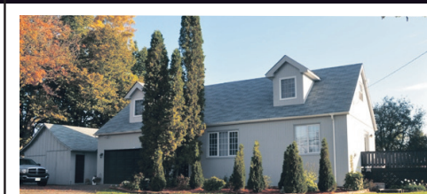
house Hosts Pamela Foy Sunday 2-4 pm 12411 8th Line, Glen Williams

Great Curb Appeal And a warm & inviting interior are yours with this charming 3 bdrm bungalow. Open concept Living/Dining Room combo with crown moulding & picture window. Cheerful cupboard-clad Kitchen with great work & storage space. Gorgeous basement Rec Room with laminate floors, gas fireplace & pool table - grab a cue! $369,900.00 Georgetown MLS#W2221181