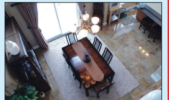
WELCOME HOME TO THIS PARK-LIKE 2.74 ACRES $664,900

Stunning, all brick, custom home featuring a modern open concept design & a unique blend of elegance & country charm. Beautifully decorated & recently improved with richly stained walnut floors, ceramics & lovely new trim & baseboards. Impressive great room with floor-to-cathedral ceiling brick fireplace. Full 1 bdrm inlaw suite beautifully done with games room, living rm w/stone fireplace & lots of pot lights. Detached dbl car garage plus a fantastic workshop (30'x55') with heat, hydro, water, 14' ceiling, 2 truck doors & mezzanine. Great location - just 20 min. to Georgetown GO. Call for full details.