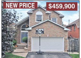
NEW PRICE $459,900

All the elegance of a million dollar home on 46 acres. Home features; granite, modern kitchen, large principal rooms, 6 walk-outs, beautiful views. Property offers: Horse Stalls, paddocks, sand ring, detached shop. More than we can mention here. Contact us for a list of features. MLS# X2138427