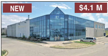
NEW $4.1 M