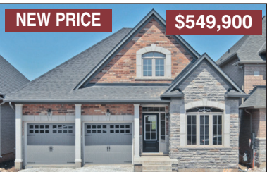
NEW PRICE $549,900

This spacious 3 + 1 Bdrm, 4 Wshrm home in the Moore Park neighbourhood in Georgetown features an open concept main floor plan with hardwood flooring. Kitchen overlooks inground pool and backyard with walk out to deck and patio. Master Bdrm has new ensuite with oversized shower & soaker tub. Basement is finished with fourth bedroom, washroom & large rec room. Call the Krause Family today!! MLS# W2190003