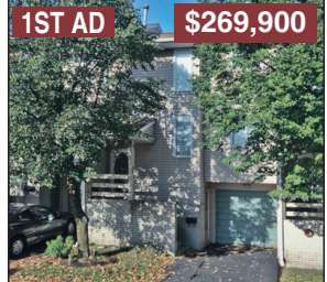
1ST AD $269,900