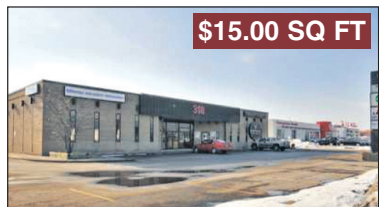
$15.00 SQ FT

This new 2 bdrm, 2 bath bungalow is loaded with upgrades! Home features 9' ceilings, hrdwd & ceramic flooring throughout, gas fireplace & a spacious double car garage. Master bdrm boasts a large W/I closet & private ensuite. Open concept kitchen has granite kitchens & pot lights. Call The Krause Team for your viewing! MLS# W2218133