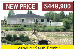
NEW PRICE $449,900

FABULOUS GTOWN SOUTH HOME Stunning 4+1 bdrm, 3 wshrm home has been finished beautifully. Open concept kit complete with servery, ceramic backsplash & flooring & water filtration system. E/I kit w/o to a two tiered deck and landscaped backyard. Family rm has a gas fireplace and hrdwd flring. Front den boasts pot lights, crown moulding and hardwood flooring. Master bdrm has a w/i closet and 5 pc ensuite with soaker tub. 3 additional good size bedrooms with laminate on 2nd floor, 5th bdrm in the partially finished bsmt. MLS# W2206333