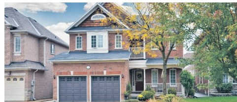
house Hosts Jennifer Sarocant Sunday 2-4 pm 63 North Ridge Cres., Georgetown

Your Family Is all that's needed to fill this 4 bdrm, 2.5 bath home. Main level with great layout including formal Living Room & Dining Room, Family Room with hardwood & gas fireplace, eat-in Kitchen & Breakfast Area with W/O to patio and private, fully fenced backyard. The double garage has room for all your bikes, trikes & a little red wagon! $574,900.00 Georgetown MLS#W2220615