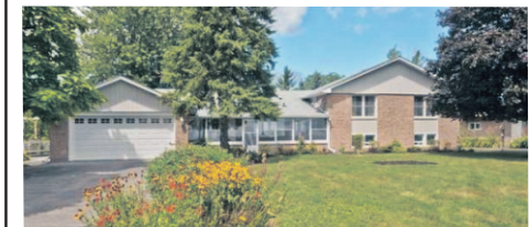
house Hosts Pamela Fey Sunday 2-4 pm 15845 River Dr., Georgetown

Great Curb Appeal And a warm & inviting interior are yours with this charming 3 bdrm bungalow. Open concept Living/Dining Room combo with crown moulding & picture window. Cheerful cupboard-clad Kitchen with great work & storage space. Gorgeous basement Rec Room with laminate floors, gas fireplace & pool table - grab a cue! $369,900.00 Georgetown MLS#W2221181