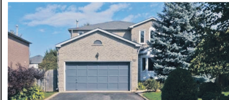
house Hosts Karen Hickling Sunday 2-4 pm 58 Webster Way, Georgetown

Your Family Is all that's needed to fill this 4 bdrm, 2.5 bath home. Main level with great layout including formal Living Room & Dining Room, Family Room with hardwood & gas fireplace, eat-in Kitchen & Breakfast Area with W/O to patio and private, fully fenced backyard. The double garage has room for all your bikes, trikes & a little red wagon! $574,900.00 Georgetown MLS#W2220615