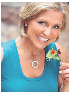
Guest Speaker Tosca Reno (Fitness model, columnist, and the author of the "Eat-Clean Diet" series)