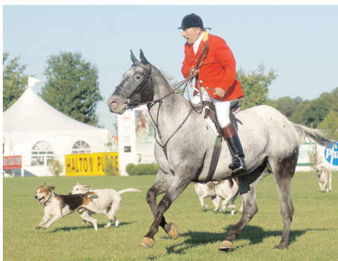
A rider takes part in a past equestrian event at Halton Place.