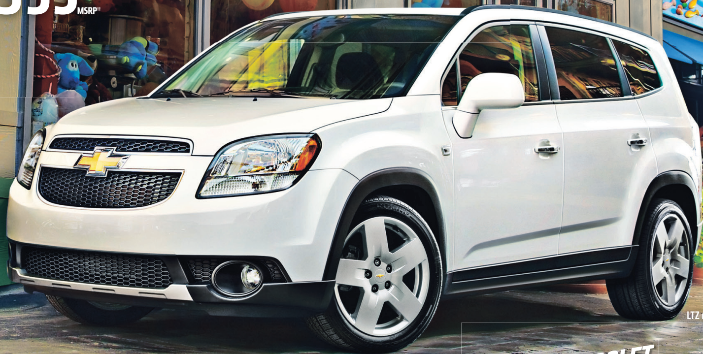
LTZ model shown*