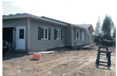
CLOUD 649! NEW 3 BDRM BUNGALOW $649,900 11-434 X2203352 latamandlatam.com