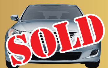
Vehicle not as shown.