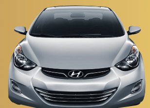
Vehicle not as shown.