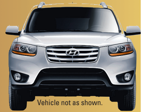
Vehicle not as shown.