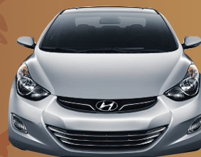
Vehicle not as shown.