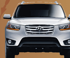
Vehicle not as shown.