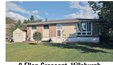
9 Ellen Crescent, Hillsburgh Sunday, October 2, 2:00-4:00 $300,000 11-383 latamandlatam.com X2180782