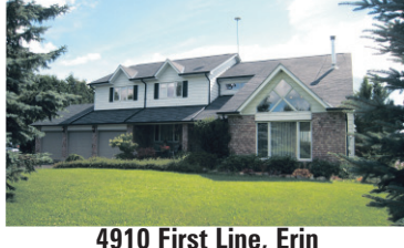
4910 First Line, Erin Saturday, October 1, 2:00-4:00 $979,000 11-014 stevejenkins.ca X2082919