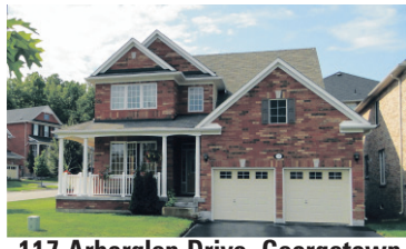
117 Arboglen Drive, Georgetown Sunday, October 2, 2:00-4:00 $549,900 11-382 PresswoodTeam.com W2204262