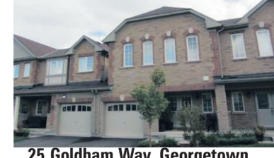
25 Goldham Way, Georgetown Saturday, October 1, 2:00-4:00 $384,900 11-390 haltonhomes.com W2182606