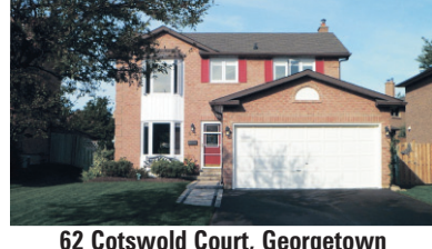
62 Cotswold Court, Georgetown Sunday, October 2, 2:00-4:00 $474,000 11-432 stevejenkins.ca* W2206376