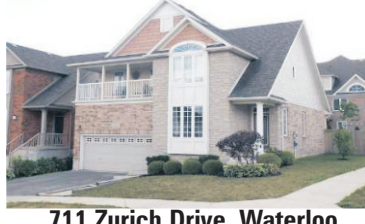
711 Zurich Drive, Waterloo Sat, Oct.1 & Sun, Oct.2, 2:00-4:00 $422,000 11-359 haltonhomes.com X2173456