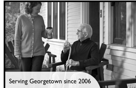
Serving Georgetown since 2006

R.R. 2, Guelph 519-856-4622 www.edenhousecarehome.ca