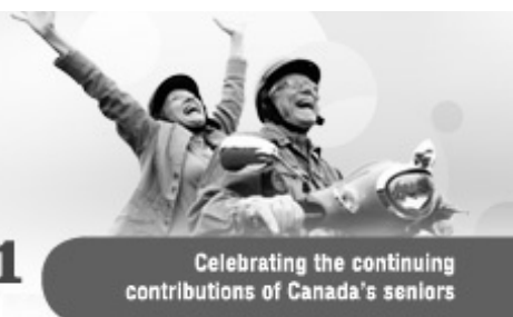
Celebrating the continuing contributions of Canada's seniors

also visit www.seniors.gc.ca to send a personalized e-postcard to the seniors in your life.