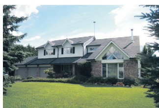
SPECTACULAR PROPERTY ON 23 ACRES $979,000 stevejenkins.ca 11-014-91 X2082919