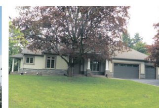
A RIVER RUNS THROUGH IT $1,295,000 PresswoodTeam.com 11-247-30 W2123218