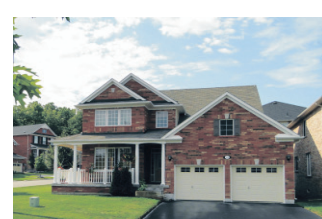
EXCLUSIVE MATTAMY BUILT HOME $569,900 PresswoodTeam.com 11-382-30 W2180317