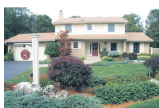
WOW FACTOR HERE! $899,900 haltonhomes.com 11-376-30 W2179448