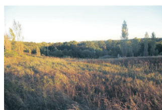
OH WHAT A VIEW - GLEN WILLIAMS $399,000 Elaine Turkington* 11-365-VL W2176055