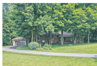
3.5 ACRES OF COUNTRY AMBIANCE $749,900 haltonhomes.com 11-299-60 W2141982