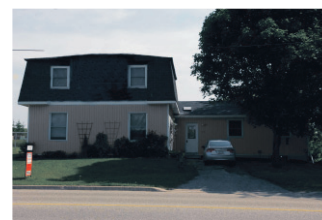
ROOM FOR THE EXTENDED FAMILY $350,000 latamandlatam.com 11-141-91 X2162295