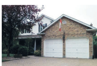
FONTHILL $469,000 stevejenkins.ca 11-211-99 X2110785