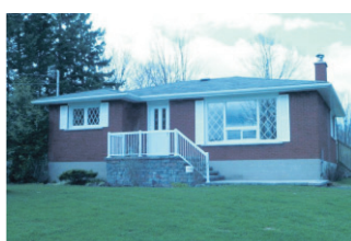
SPECTACULAR 1/2 ACRE COUNTRY PROPERTY $434,900 stevejenkins.ca 11-212-90 W2113004