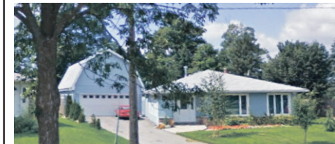
house Host: Holly Light Sunday 2-4 pm 75 Joycelyn Cres., Georgetown

Walk the Kids Down the street to Joseph Gibbons Public School and Park! This updated 3+1 bdrm, 2 bath bungalow is located in friendly neighborhood & offers fully fenced backyard with patio, hot tub, gazebo & I/G pool! Bright main level & finished Bsmt with 4th bdrm, 3 piece bath & spacious Rec Room with gas F/P & pool table - perfect for entertaining! $449,900.00 Georgetown MLS# W2199388