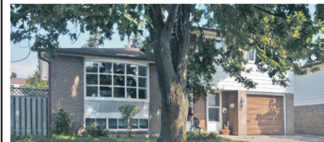
house Host: Tracy Myers Sunday 2-4 pm 16 Marilyn Cres., Georgetown

Morning Coffee In the Sunroom or on the tiered deck in your fully fenced backyard with gorgeous solar-heated I/G pool and perennial gardens. Well maintained 3 bdrm, 2.5 bath home with open concept Living & Dining Rooms, Kitchen with great work/storage space, lower level Family Room with wood-burning F/P & finished Basement. $474,900.00 Georgetown MLS# W2199775