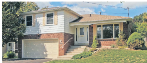
house Host: Danny Fey Sunday 2-4 pm 6 Eden Place, Georgetown

Morning Coffee In the Sunroom or on the tiered deck in your fully fenced backyard with gorgeous solar-heated I/G pool and perennial gardens. Well maintained 3 bdrm, 2.5 bath home with open concept Living & Dining Rooms, Kitchen with great work/storage space, lower level Family Room with wood-burning F/P & finished Basement. $474,900.00 Georgetown MLS# W2199775