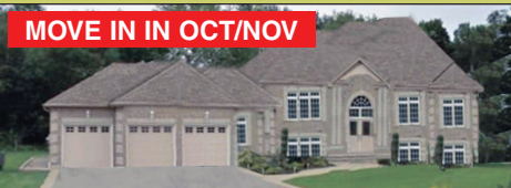
MOVE IN IN OCT/NOV

Sprawling, 4 bdrm California style bungalow features an unique layout with massive principal rooms having soaring cathedral ceilings, 2 floor to ceiling fireplaces, lovely newer kitchen, gleaming hardwood floors, all replaced windows, roof (2005), 200 amp service, high speed internet & freshly painted thruout. Convenient main floor laundry and brand new powder room. Gorgeous mature landscaping, tandem 4 car garage and a long driveway that holds a dozen cars. Excellent location - only 15 minutes to 401 and walk to GO train later this year.