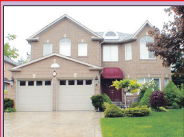
RAVINE BACKDROP RIGHT OUT OF A MAGAZINE ON AN "IT" STREET IN G'TOWN SOUTH $834,900

Stunning, all brick, custom home featuring a modern open concept design & a unique blend of elegance & country charm. Beautifully decorated & recently improved with richly stained walnut floors, ceramics & lovely new trim & baseboards. Impressive great room with floor-to-cathedral ceiling brick fireplace. Full 1 bdrm inlaw suite beautifully done with games room, living rm w/stone fireplace & lots of pot lights. Detached dbl car garage plus a fantastic workshop (30'x55') with heat, hydro, water, 14' ceiling, 2 truck doors & mezzanine. Great location - just 20 min. to Georgetown GO. Call for full details.