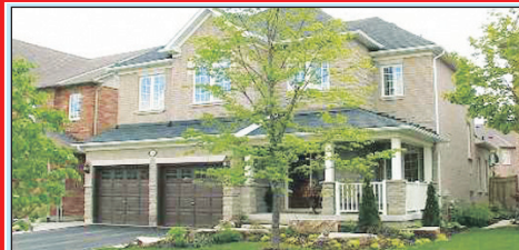
16 NORTH RIDGE CRES. $639,900

Beautifully maintained show-piece home with a whopping 3600 sq. ft plus a walkout bsmt awaiting your ideas. Gorgeous patterned concrete balcony & patio plus concrete ballisters & handrails that have a grandiose Tuscan feel - and a wrought iron circular staircase to boot! Prof. landscaped with a concrete driveway that sets this house apart with its amazing curb appeal. Pride of ownership inside & out...plaster crown mouldings, custom trim and baseboards, 9' ceilings on main flr, french doors, hrdwd flrs & stylish ceramics throughout, California shutters, solid staircase. Excellent layout on every floor with amazing square rooms! Professionally painted top to bottom, master bdrm retreat with 5pc bthrm out of Trump Tower that you have to see!