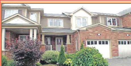
824 GIFFORD CRESCENT $314,900

JUST SOLD Get the Most Experience Working For You.