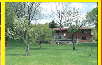
APPROX. 1 ACRE OF GORGUESNESS, VERY NEAT LAYOUT WITH GREAT ACCESS TO TOWN! $584,900

Sprawling, 4 bdrm California style bungalow features an unique layout with massive principal rooms having soaring cathedral ceilings, 2 floor to ceiling fireplaces, lovely newer kitchen, gleaming hardwood floors, all replaced windows, roof (2005), 200 amp service, high speed internet & freshly painted thruout. Convenient main floor laundry and brand new powder room. Gorgeous mature landscaping, tandem 4 car garage and a long driveway that holds a dozen cars. Excellent location - only 15 minutes to 401 and walk to GO train later this year.