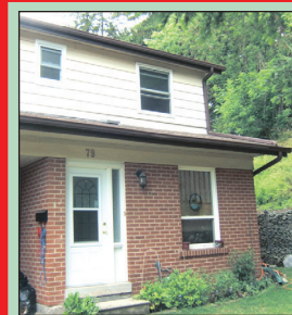
THE PERFECT STARTER HOME $209,900

SOLD Get the Most Experience Working For You.