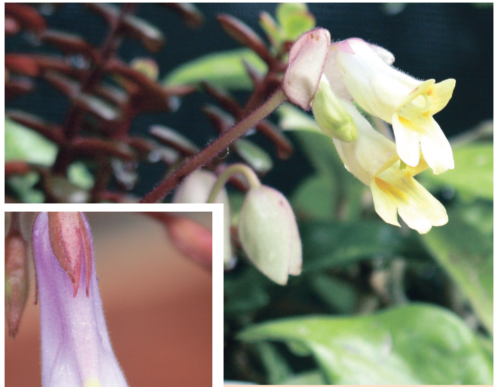
Above: Chirita with hoya Left: Chirita

Connecting your business to technology solutions that WORK!