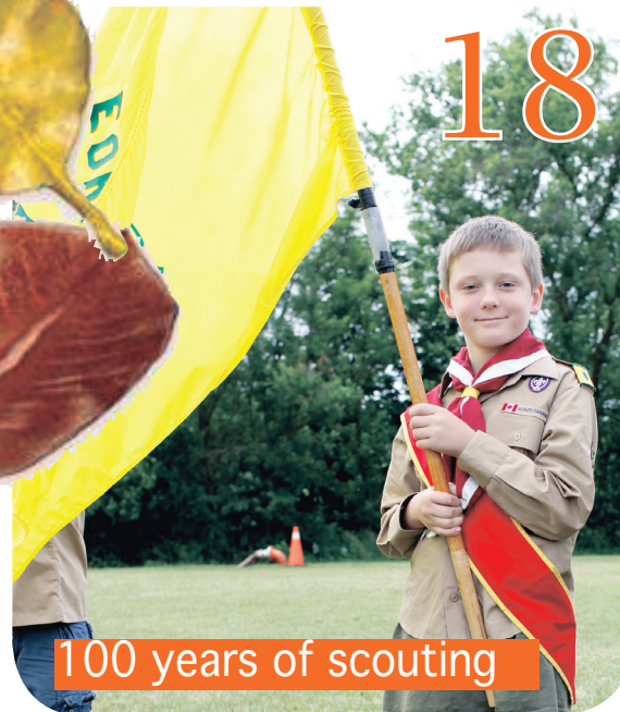
100 years of scouting