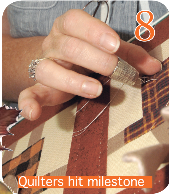
Quilters hit milestone