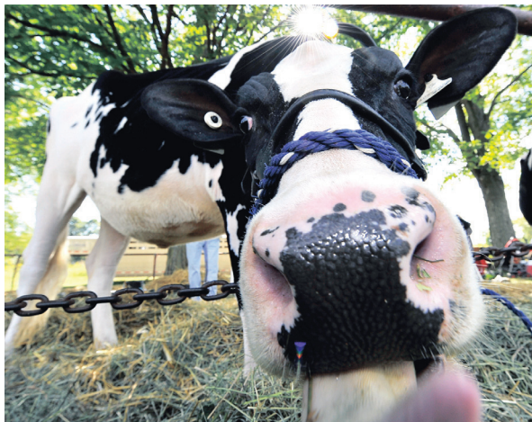
You can get up close and way too personal with the animals at the Acton Fall Fair as a friendly cow decided to share a kiss with our photographer.